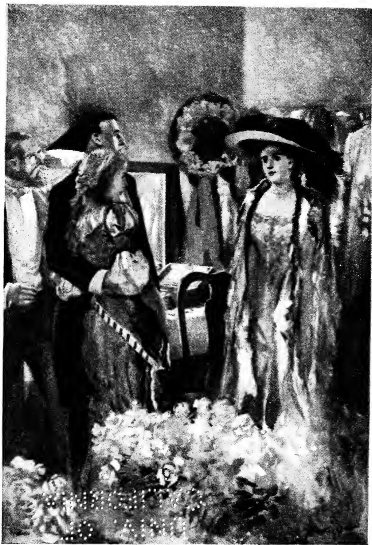
"He turned and saw Nan"